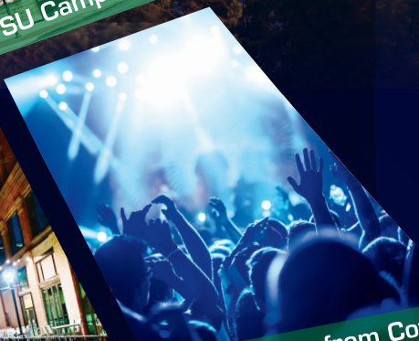
Steps away from Covelli Center and The Youngstown Foundation Amphitheatre