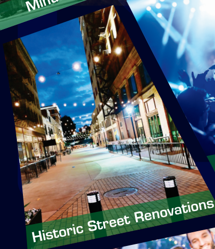
Historic Street Renovations