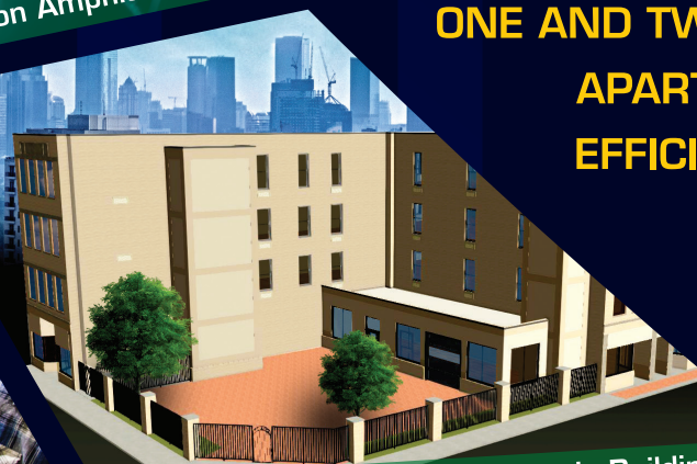
Breathtaking Restored Historic Building