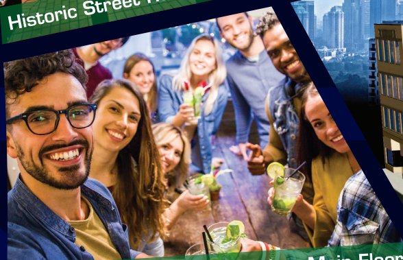
Restaurant/Lounge Located on Main Floor